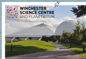
Winchester Science Centre