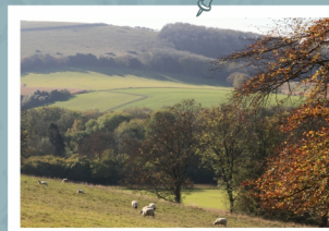
Old Winchester Hill