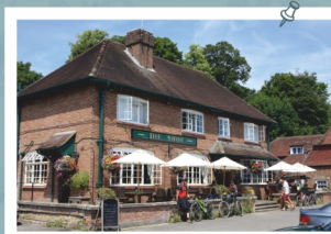
"The Shoe" at Exton