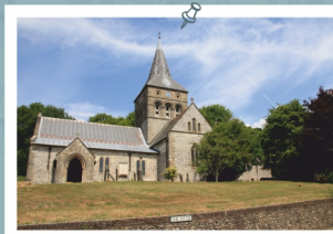
All Saints church at East Meon